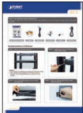
Quick Installation Guide

The package box should contain the items indicated below plus DKVM-1708/DKVM-1716. If any item is missing or damaged, please contact the seller immediately.